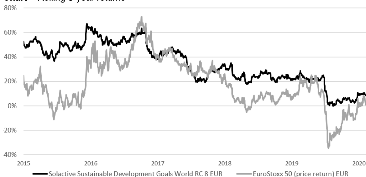
Chart – Rolling 5-year returns

Source: Solactive, returns since Dec 2000 simulated, live returns since Sep 2016